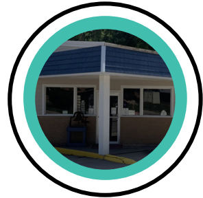
City of Scandia $12,000

The grant we received made our dream of revitalizing the Scandia Museum a reality. With the funds, we re-sided the museum, giving it a fresh, appealing look that has already made a significant impact on our community. The transformation inspired events that drew volunteers, donations, and support, and an art exhibit by a local artist further attracted crowds. This renovation has turned the museum into a true attraction, renewing community interest and engagement. We are deeply grateful to the Community Foundation and look forward to future partnerships.