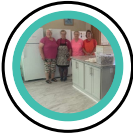
Church People Concerned Foundation $3,000

The Community Foundation grants committee accepts and reviews applications twice a year, in the Spring and Fall, to address current community needs.